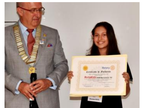
Rotakids Barcelona 92, founded in March 2017

It is not difficult to create a Rotakids; it starts with the creation of a group of children which can be sons and daughters nieces and nephews or neighbours of some Rotarians, or a school which already has an Interact club established. The sponsoring club should form a committee that with the help of the spouses accompany the future Rotakidians. Guide by the sponsoring club, the Rotakids club have their administrative and financial autonomy. And like any other Rotary club, they have their president and board of directors.